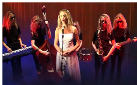
still from Body Double 17

NEXT EXHIBITION: Tracey Emin – 22 May – 3 July 2004