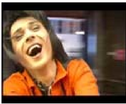
still from Body Double 13