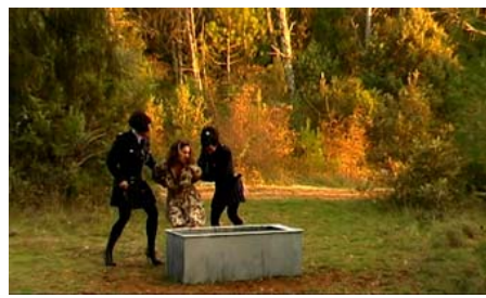
still from Body Double 16