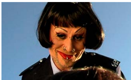
still from Body Double 16