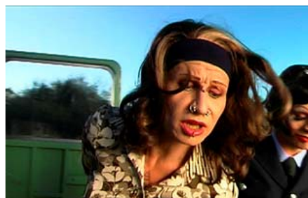
still from Body Double 16