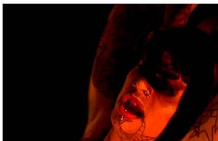
still from Body Double 16