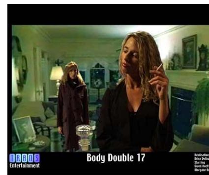
still from Body Double 17